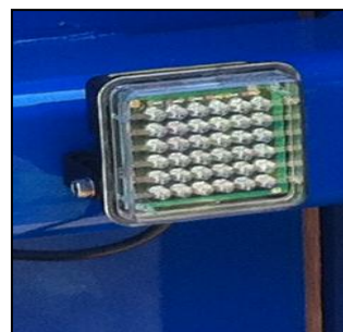
Flashing Strobe Light