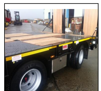
Rear Steer Axle