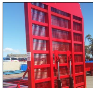
Eco Mesh Ramps