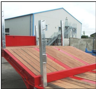
Galvanised Posts With Handles