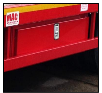
Large Steel Toolbox