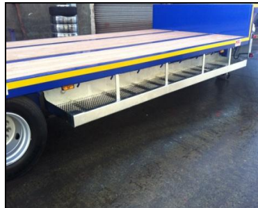
Demountable Galvanised Timber Trav