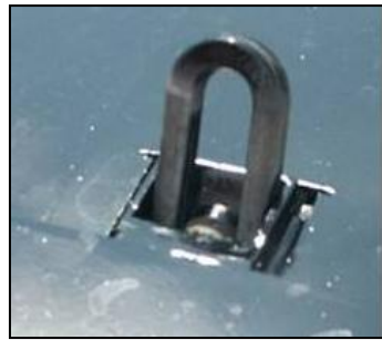
3.5T Lashing Eye (Platform)