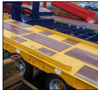
Machine Locker Bars