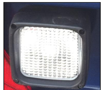
Wisem Working Spot Lights