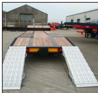
23T Alloy Ramps