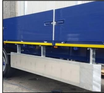
Galvanised Crash Rail