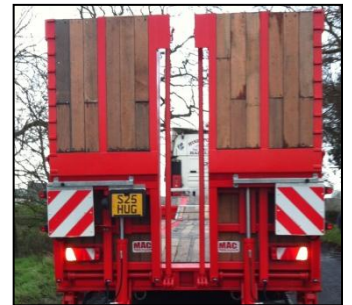
1m Wide Fliptoe Ramps