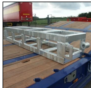
Stepframe Container Leveller