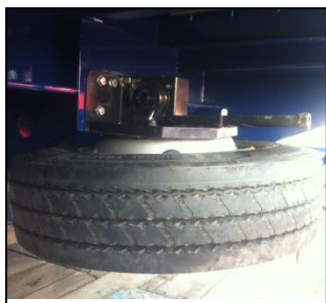
Spare Wheel Carrier Underneath