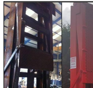
Access Equipment Ramps