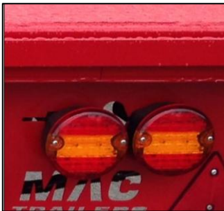
LED Hamburger Lights