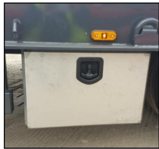
Stainless Steel Toolbox