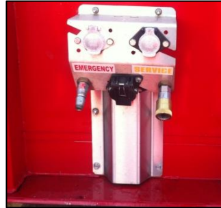
Suzi Box on Headboard