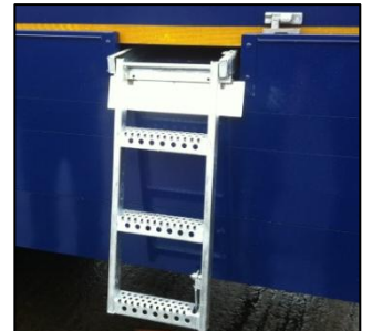
Pull Out Access Ladder