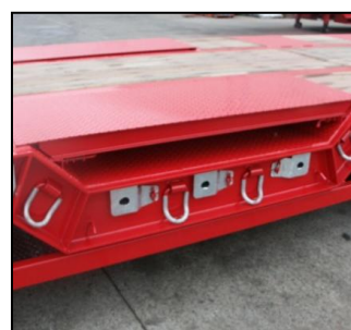
Combine Wells with Covers