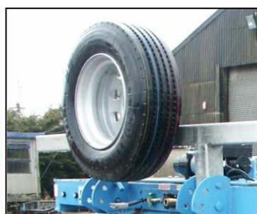
Spare Wheel on Tractor Headboard