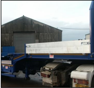
Aluminium Demountable Crib Sides