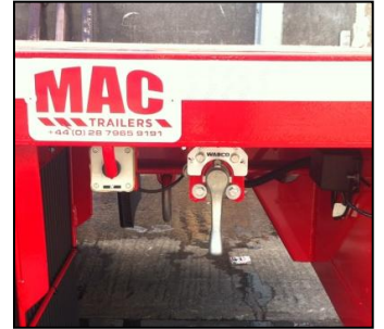
Raise / Lower Valve