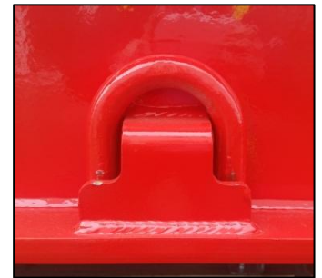
D-Rings on Chime