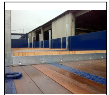
Hardwood Cross Bearers