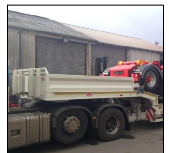
Crib Sides Painted