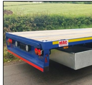
Galvanised Post Carrier