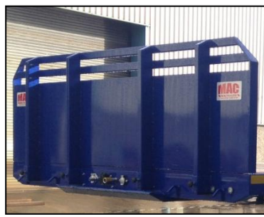
Solid 600mm Static Headboard