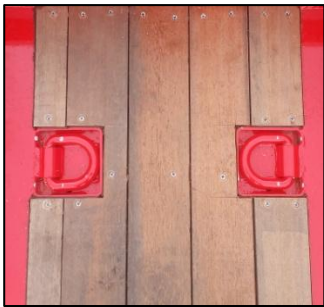
Recessed D-Rings in Platform