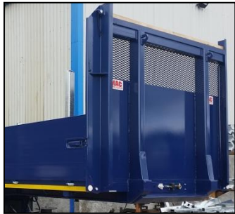
5Ton Weight Bearing Headboard