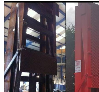
Access Equipment Ramps