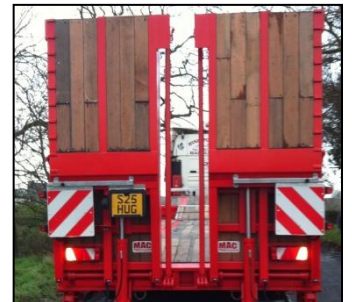
1m Wide Fliptoe Ramps