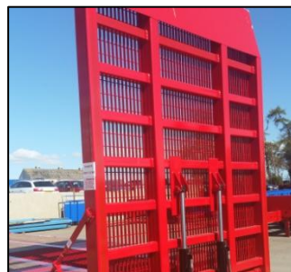
Eco Mesh Ramps