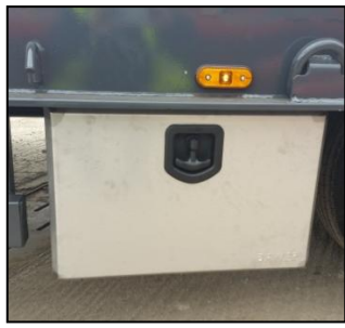
Stainless Steel Toolbox