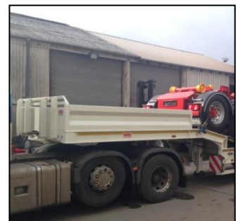
Crib Sides Painted