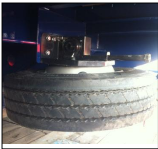
Spare Wheel Carrier Underneath