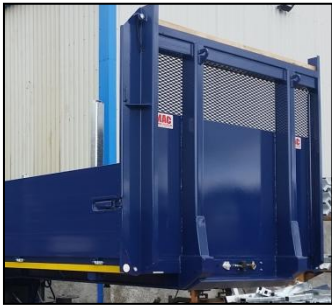
5Ton Weight Bearing Headboard