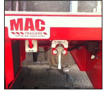
Raise / Lower Valve