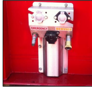
Suzi Box on Headboard