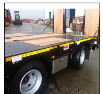
Rear Steer Axle