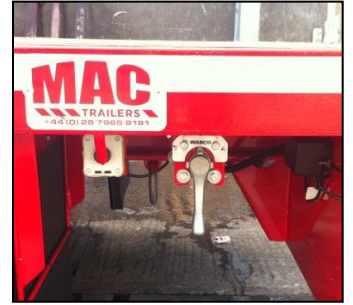
Raise / Lower Valve