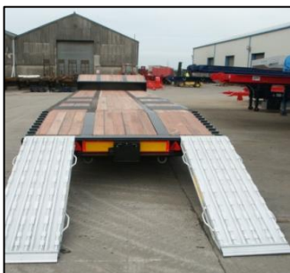
23T Alloy Ramps