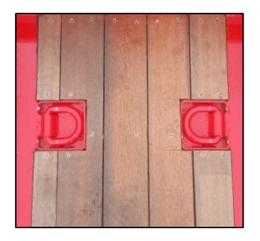
Recessed D-Rings in Platform