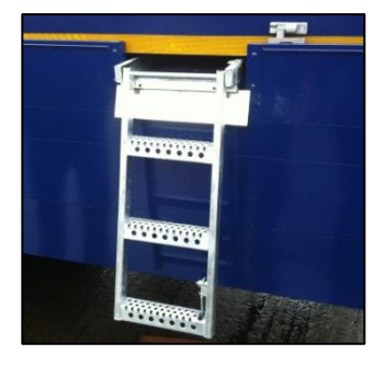
Pull Out Access Ladder