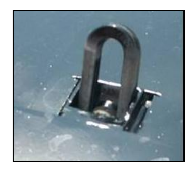
3.5T Lashing Eye (Platform)