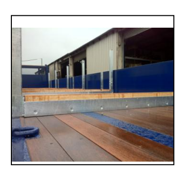
Hardwood Cross Bearers