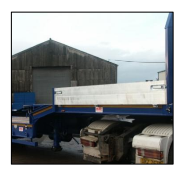
Aluminium Demountable Crib Sides