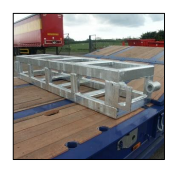
Stepframe Container Leveller