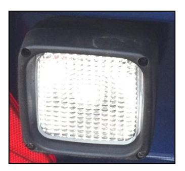
Wisem Working Spot Lights