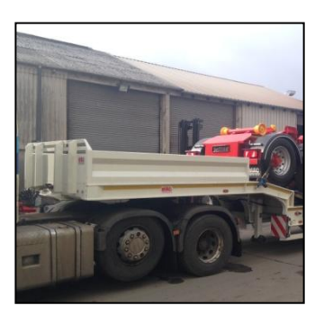
Crib Sides Painted