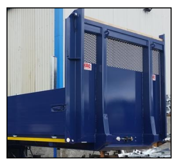
5Ton Weight Bearing Headboard