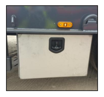
Stainless Steel Toolbox