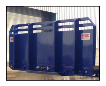
Solid 600mm Static Headboard