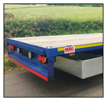
Galvanised Post Carrier