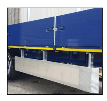
Galvanised Crash Rail