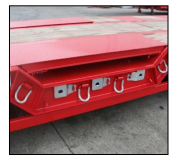
Combine Wells with Covers