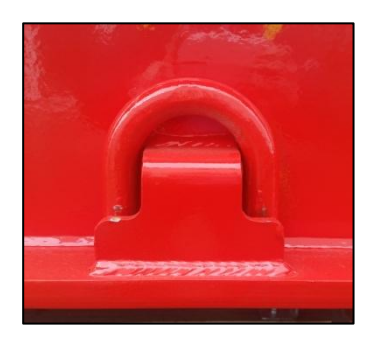
D-Rings on Chime