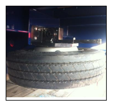
Spare Wheel Carrier Underneath