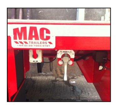
Raise / Lower Valve