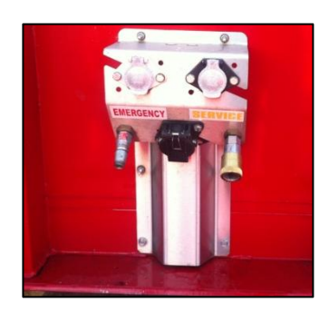
Suzi Box on Headboard