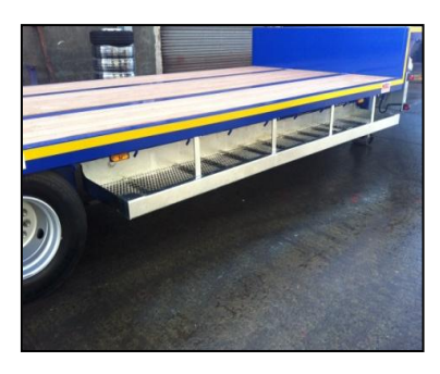
Demountable Galvanised Timber Trav