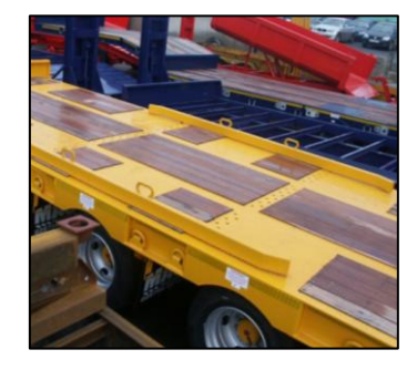
Machine Locker Bars