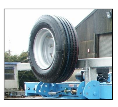
Spare Wheel on Tractor Headboard