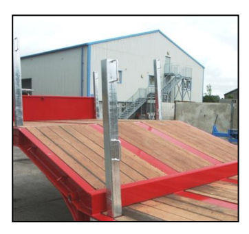
Galvanised Posts With Handles