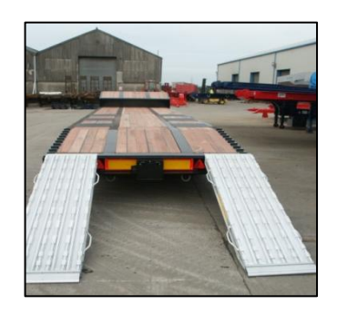
23T Alloy Ramps