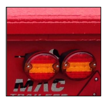
LED Hamburger Lights