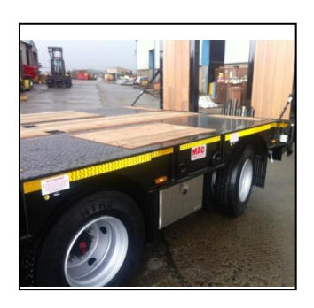
Rear Steer Axle