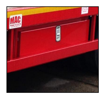
Large Steel Toolbox