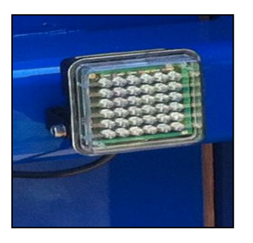
Flashing Strobe Light