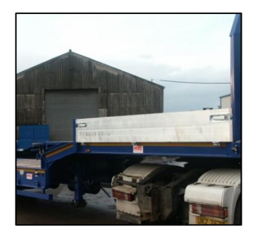
Aluminium Demountable Crib Sides