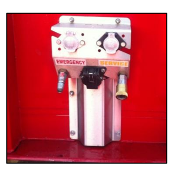
Suzi Box on Headboard