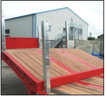
Galvanised Posts With Handles