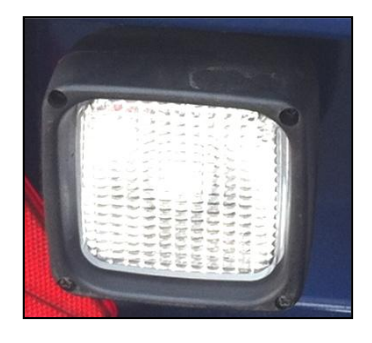
Wisem Working Spot Lights