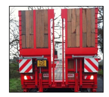
1m Wide Fliptoe Ramps