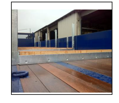
Hardwood Cross Bearers