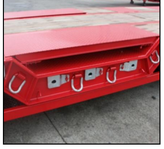
Combine Wells with Covers