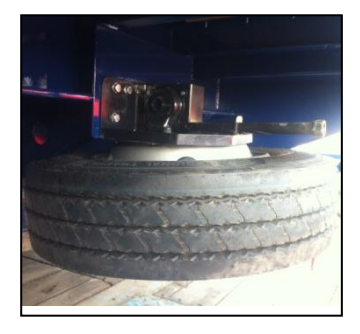
Spare Wheel Carrier Underneath