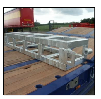
Stepframe Container Leveller