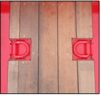
Recessed D-Rings in Platform