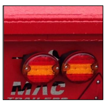
LED Hamburger Lights