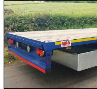
Galvanised Post Carrier