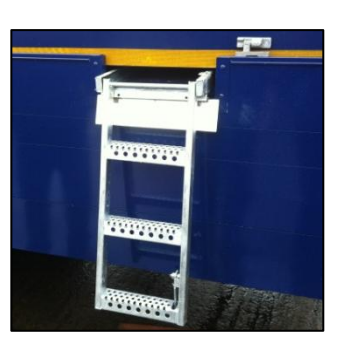
Pull Out Access Ladder