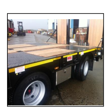
Rear Steer Axle