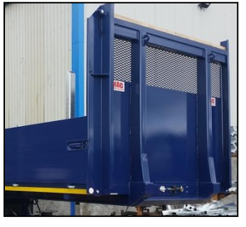
5Ton Weight Bearing Headboard