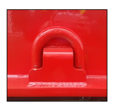
D-Rings on Chime