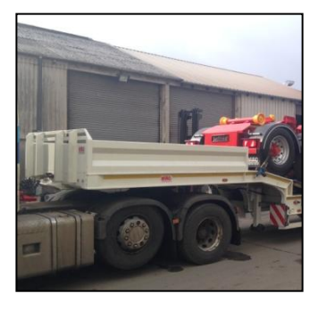
Crib Sides Painted