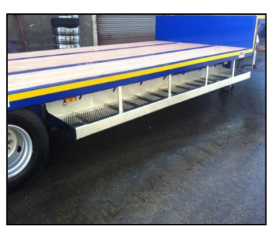
Demountable Galvanised Timber Trav