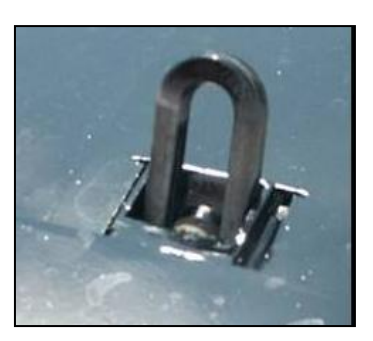
3.5T Lashing Eye (Platform)