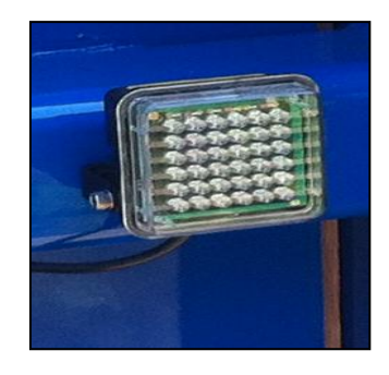
Flashing Strobe Light