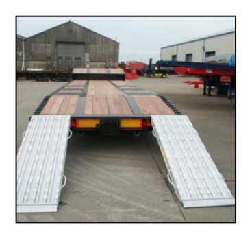
23T Alloy Ramps