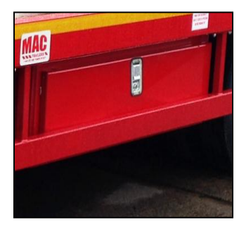
Large Steel Toolbox