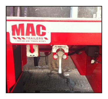
Raise / Lower Valve