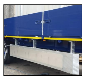
Galvanised Crash Rail