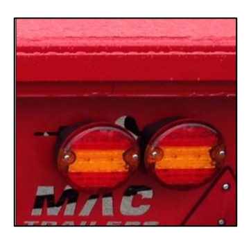
LED Hamburger Lights