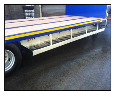
Demountable Galvanised Timber Trav