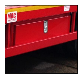
Large Steel Toolbox