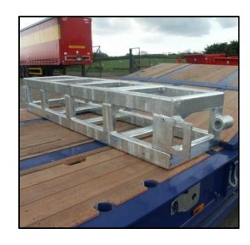
Stepframe Container Leveller