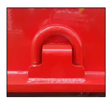
D-Rings on Chime