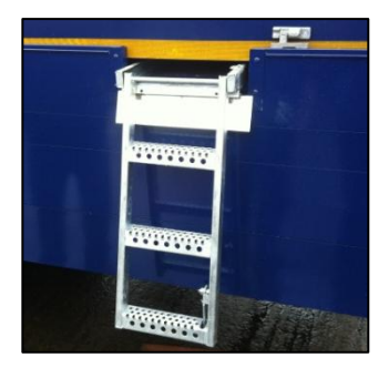
Pull Out Access Ladder