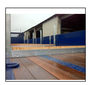
Hardwood Cross Bearers