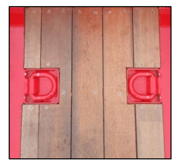
Recessed D-Rings in Platform