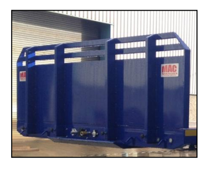
Solid 600mm Static Headboard