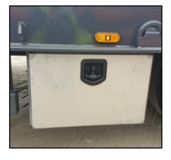
Stainless Steel Toolbox