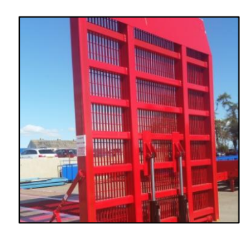
Eco Mesh Ramps