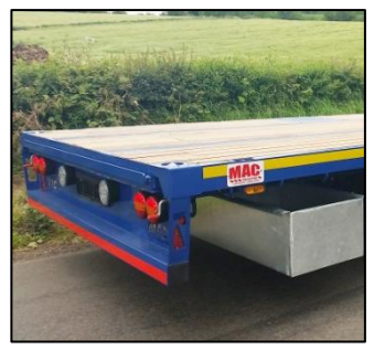
Galvanised Post Carrier