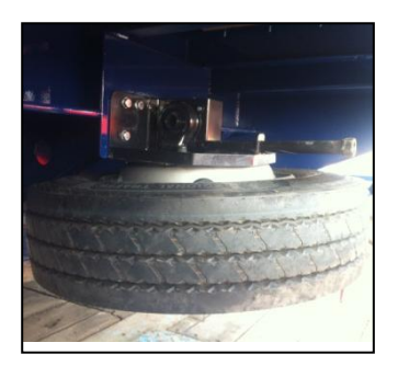
Spare Wheel Carrier Underneath