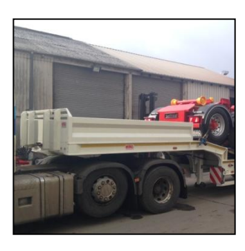
Crib Sides Painted