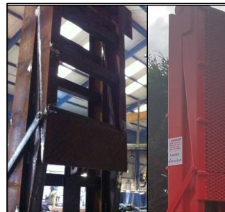
Access Equipment Ramps